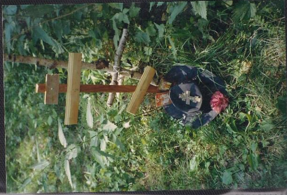
ELGA MADE CROSS - I WANT 'THE CHILDREN'. SMALL SEMAPHORE WITH WATER (FORGET-ME-NOT FLOWER) ON LEFT OF HAT