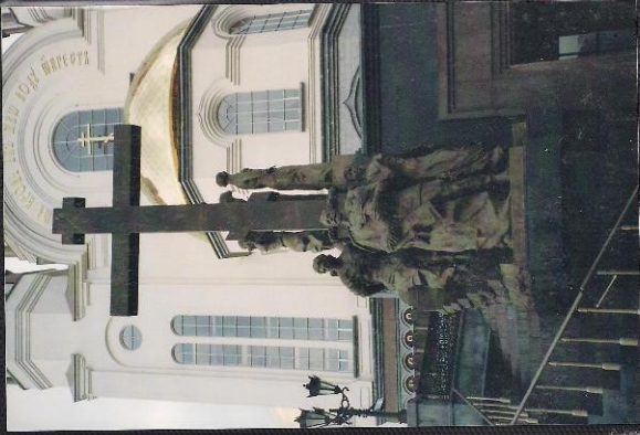
THE NEW CROSS 23 STEPS AS PER DOWN TO CELLAR