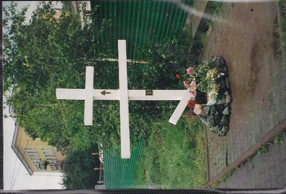
THE FIRST 'OFFICIAL' CROSS (NOW AT SIDE) INSRIPTION