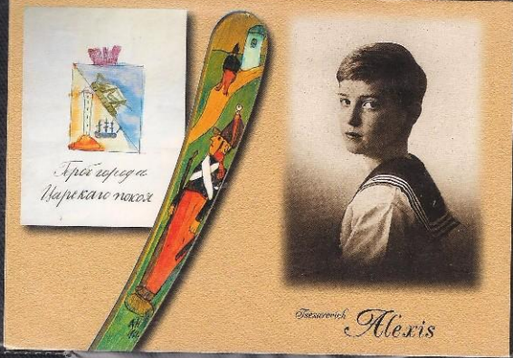
Три сироты Нахранили маме