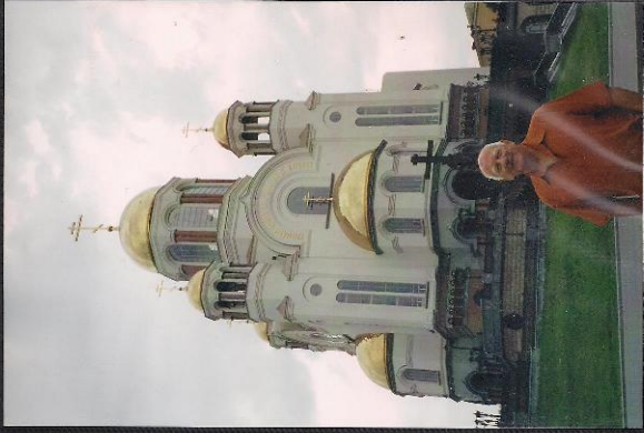
FIRST VISIT -- HAPPY OUTSIDE (EMOTIONAL/DIFFICULT INSIDE) | LADY GUIDE GAVE ME ION