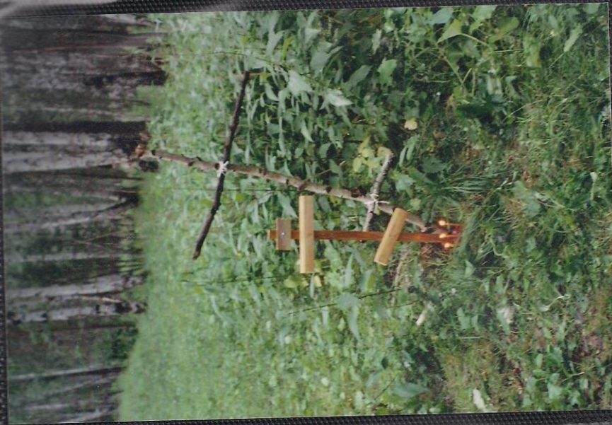
THREE CANDLES NEXT DAY (LIT WITH MATCH) (-WOOD)