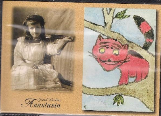
Grand Duchess Anastasia